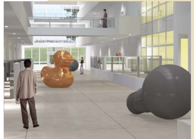
Atrium with sculptures designed by Stark scheduled for installation in June and July.

Hopefully you have already seen and enjoyed the changes in Building #4. Similar improvements are being made in the other buildings' Atria by our teams of painters, carpet installers, concrete finishers, and landscapers working at Parris Landing. We expect interior common area work to continue through May, with the sculptures designed by Starck scheduled for installation in June and July. We understand that this work is sometimes inconvenient and appreciate your patience as we work toward a common goal of making Parris Landing a stunning residence.