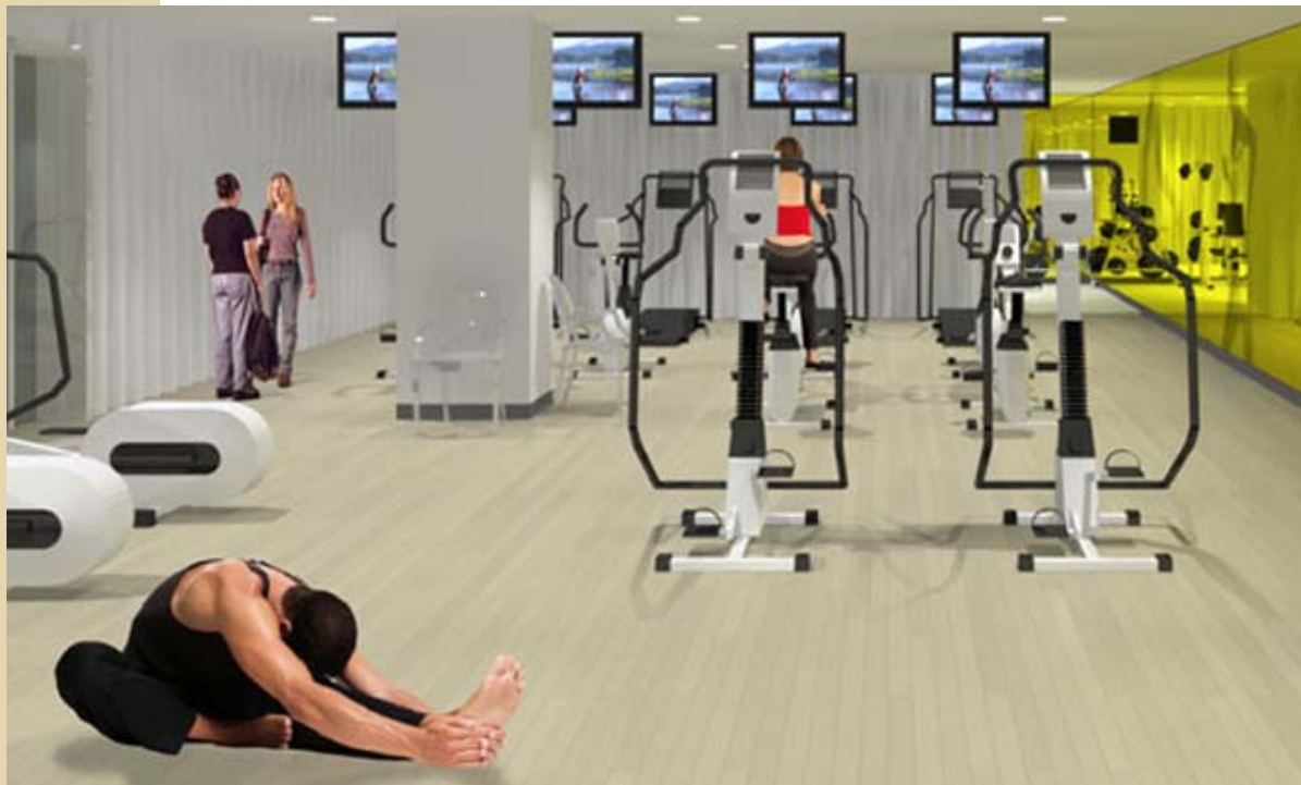
A very "Wow" state-of-the-art fitness center.

While our workers are constructing the new Philippe Starck inspired fitness center, we will temporarily relocate some of the existing fitness equipment to another area within Parris Landing. Work is currently expected to begin at the end of March or beginning of April. We will let residents know as soon as we start the move so you can keep your 2005 workout resolutions!