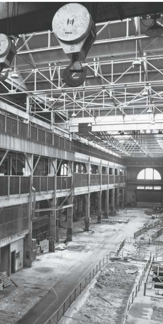
Original Navy shipbuilding.

We've talked extensively about the strong influence of Philippe Starck and his design team at YOO, but we have failed to mention the acclaimed local talent we have as part of the design and construction drawing development team. We are extremely pleased to