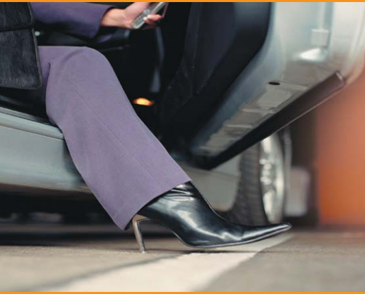
Three levels of parking: Levels one and two will be self-parking and level three will be reserved for valet parking.

Currently, renovation work is scheduled to begin in May. In order to minimize the disruption time and eliminate any risk of damage to your vehicles, we will be completely evacuating the garage during the renovation phase. We expect the work to take three to four months. During this time, parking will be provided at no cost to residents in a BRA owned lot within the Navy Yard. A drop-off location will be set up at Parris Landing for packages, groceries, etc. and a shuttle will be run every 15 minutes from the lot to Parris Landing and back.